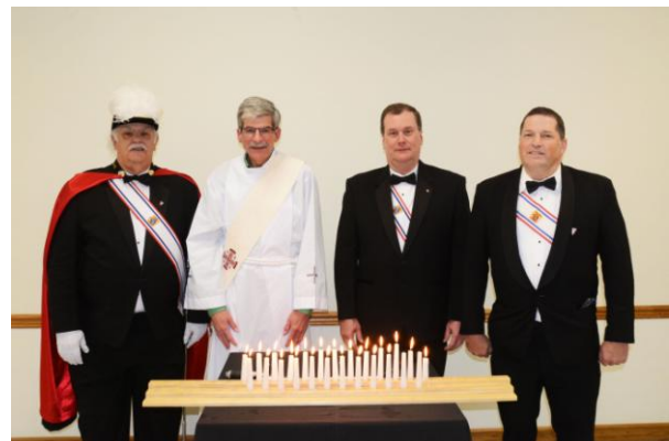
PHOTO FROM THE COUNCIL'S NOVEMBER MEMORIAL SERVICE