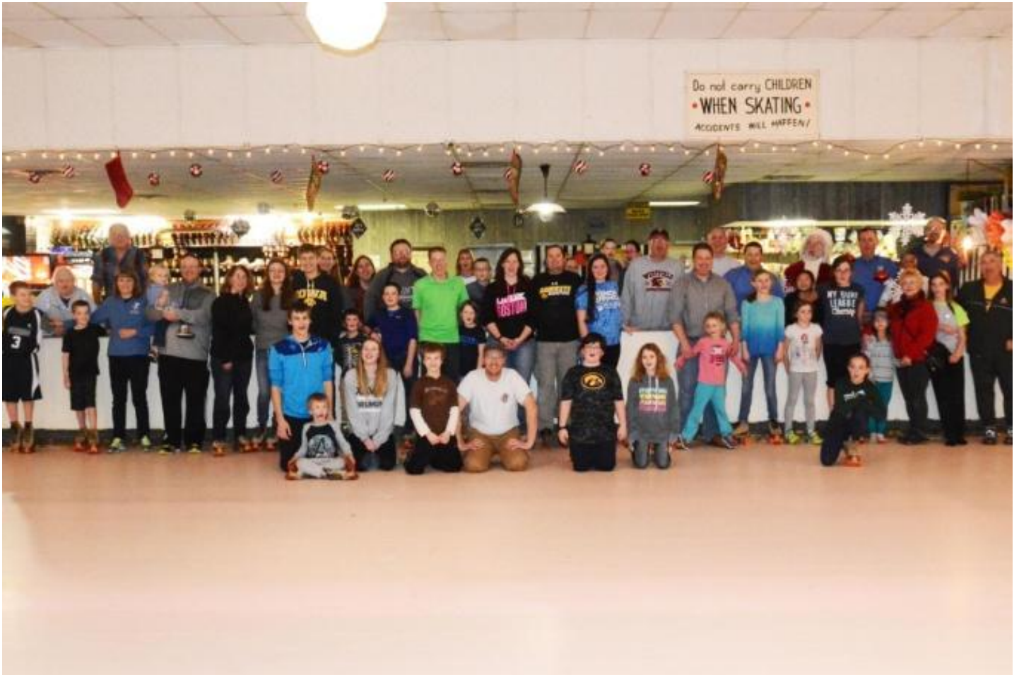
WINTER SKATING PARTY PICTURE