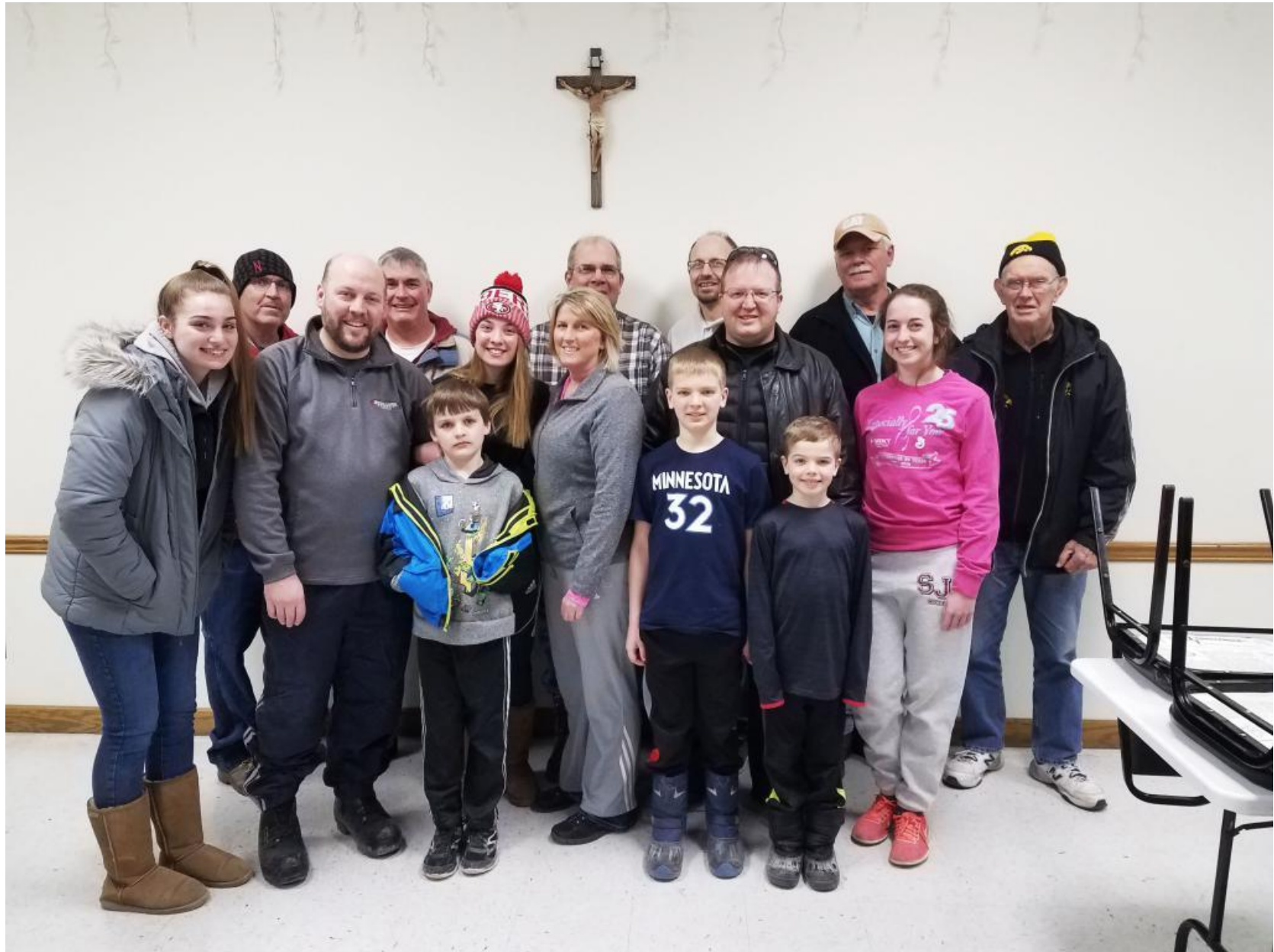
THE HARD WORKING SPRING 2018 HIGHWAY CLEANUP WORK CREW