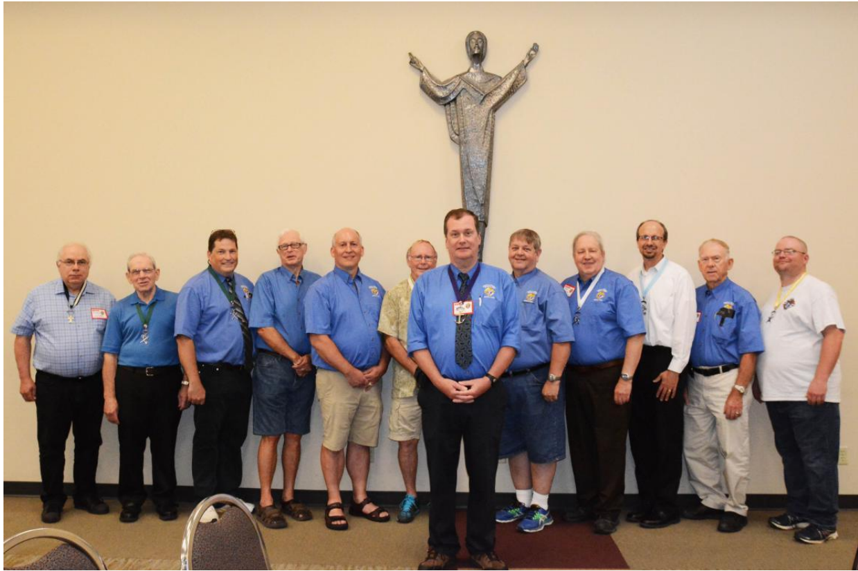
OFFICER INSTALLATION PHOTO