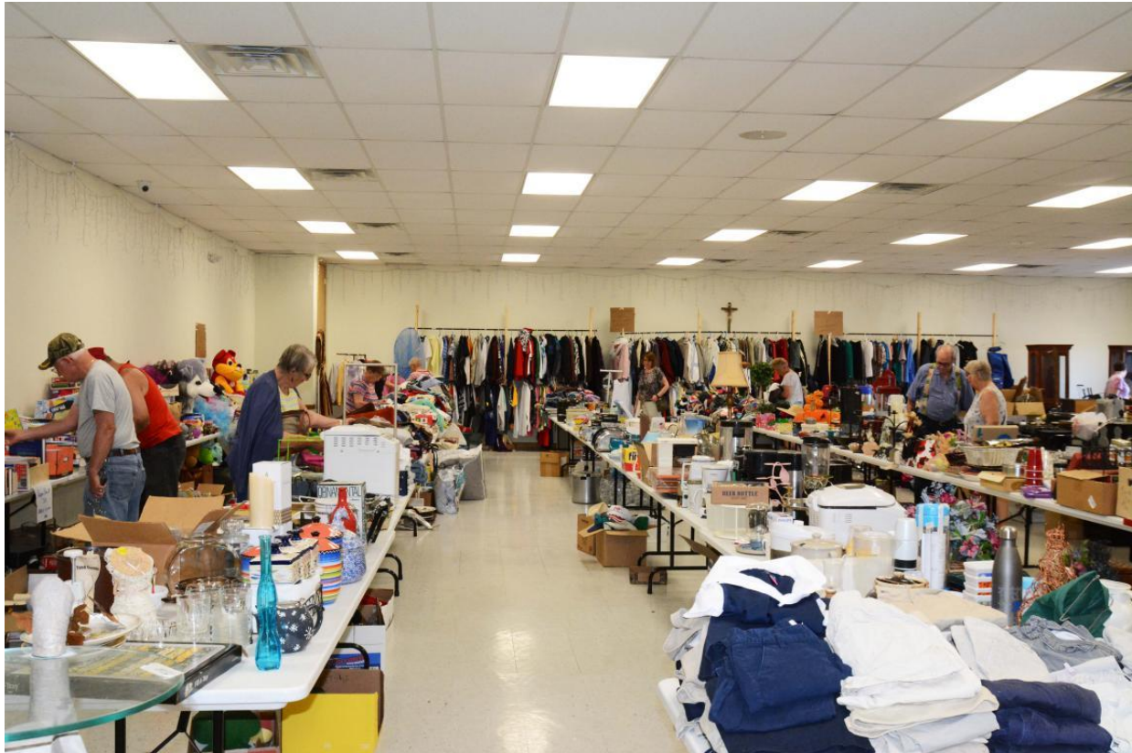
SCENE FROM THE MCC GARAGE SALE