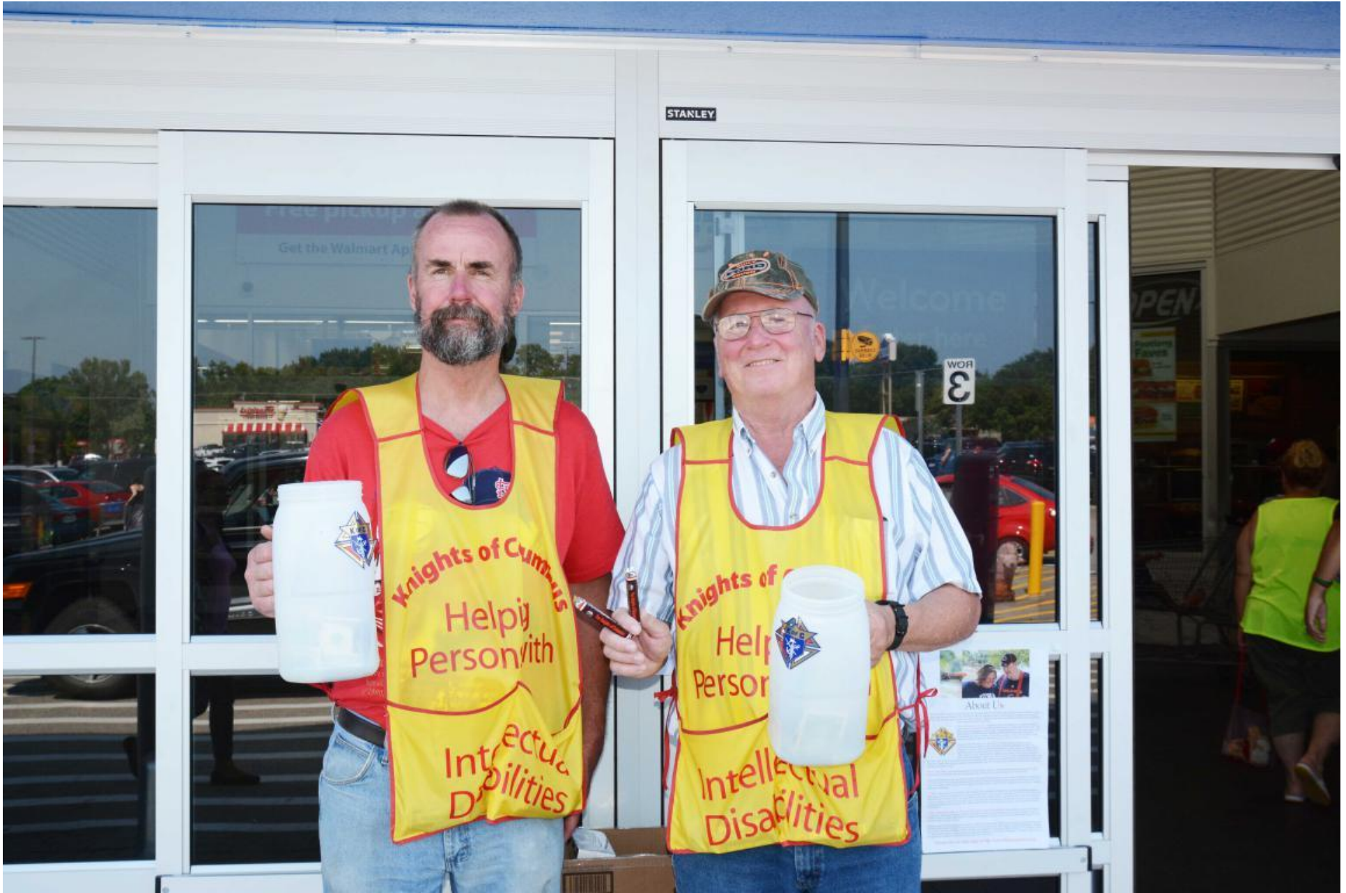
CPID DRIVE WORKERS