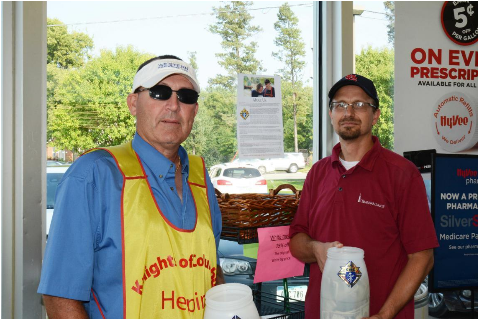
CPID DRIVE WORKERS