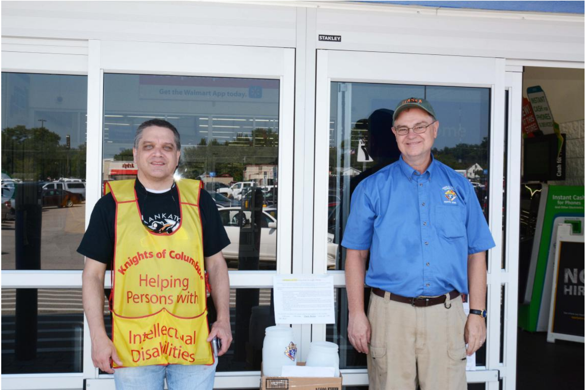
CPID DRIVE WORKERS