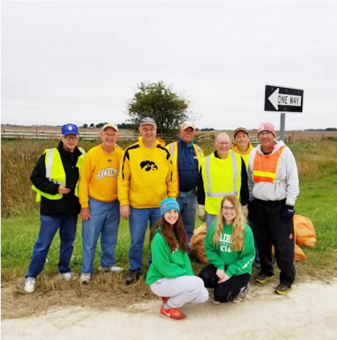
FALL HIGHWAY CLEAN-UP WORK CREW